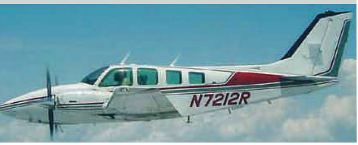
Baron 58 (IO-550)

In 1984 the Baron received 300 hp IO-550 engines for more power and a higher maximum gross weight. The flight controls and instrument panel were redesigned. These Baron 58s provide the perfect base for customizing with the very latest avionics and equipment upgrades.