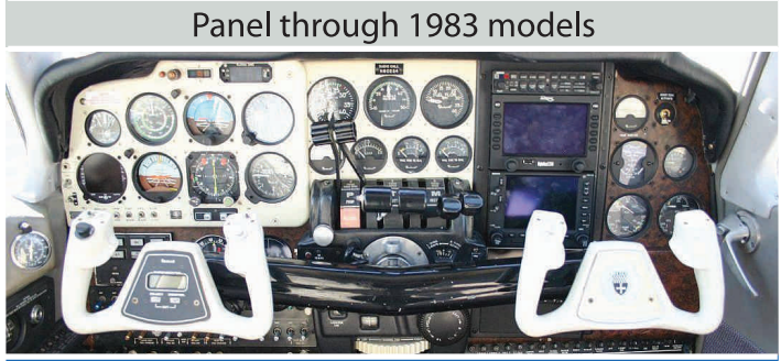
Panel through 1983 models